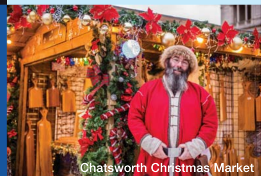
Chatsworth Christmas Market

View and share this tour online - click on View Your Tour at www.tailored-travel.co.uk and quote nwtd241