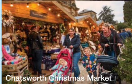
Chatsworth Christmas Market