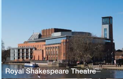
Royal Shakespeare Theatre