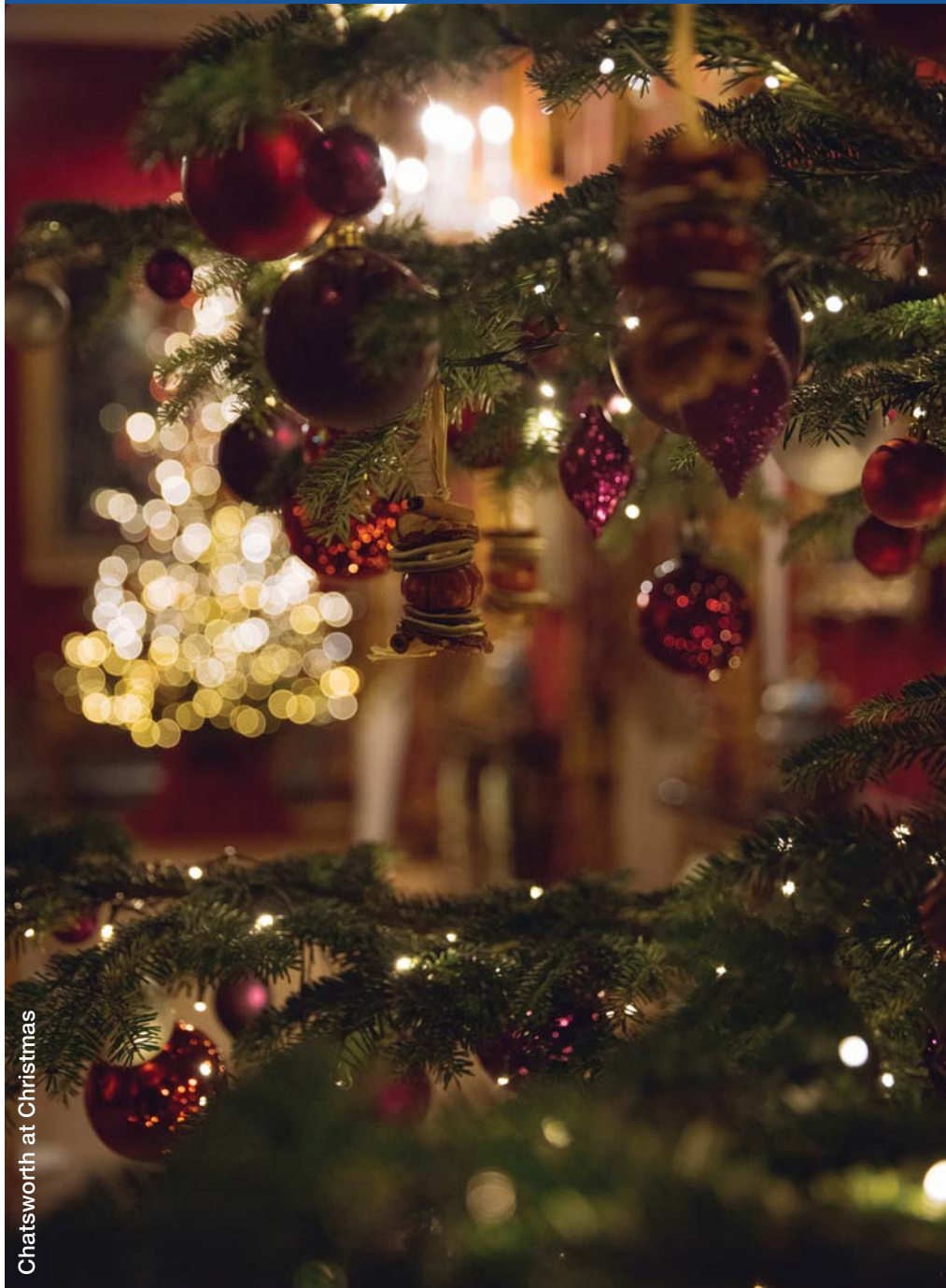
Chatsworth at Christmas

Price based on twin share. Minimum numbers required. Normal booking conditions apply.