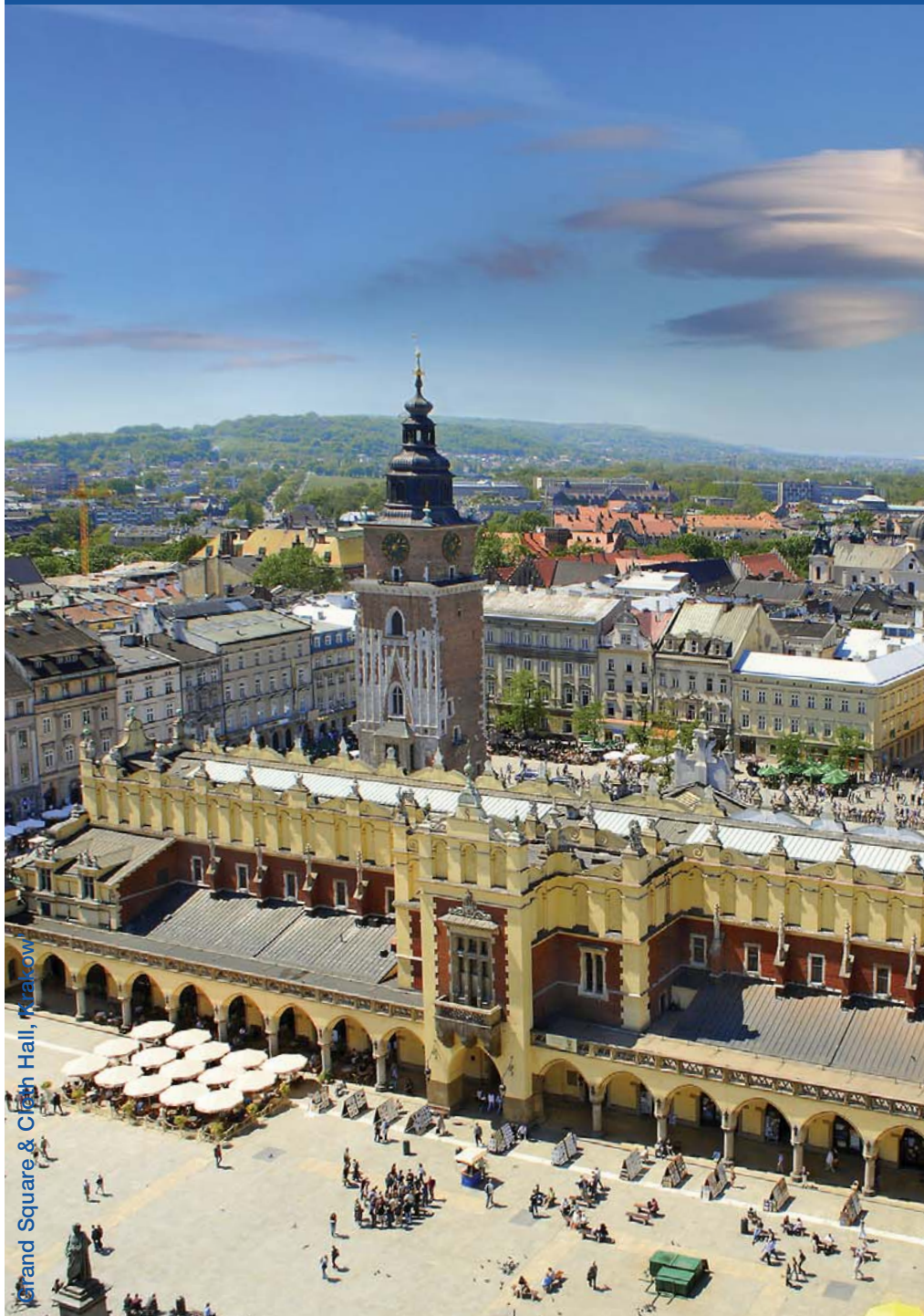
Grand Square & Cloth Hall, Krakow

Flight details may be subject to change. Price based on twin share. Minimum numbers required. Normal booking conditions apply.