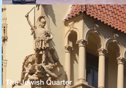
The Jewish Quarter

5 days from £849 Departs 3rd October 2019