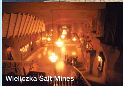
Wieliczka Salt Mines