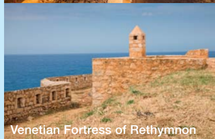
Venetian Fortress of Rethymnon

8 days from £1,899 Departing 30th September 2024