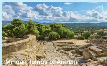
Minoan Tombs of Armeni

Aptera Souda Bay War Cemetery Samaria Gorge Chania Minoan Tombs of Armeni Palace of Phaistos Royal Villa of Agia Triada Knossos Guided tour of Heraklion Margaritas Melidoni Cave Eleftherna Guided tour of Rethymnon Venetian Fortress of Rethymnon